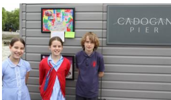
Local school art lessons at Cadogan Pier