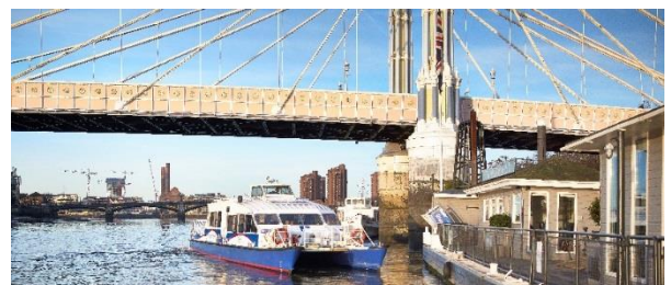
Thames Clipper at Cadogan Pier

THAMES CLIPPERS – We are delighted that each month more local residents and visitors are using the Thames Clipper river bus service to and from Cadogan Pier. We are happy to have supported a new timetable that sees an increase in services to and from the Pier.