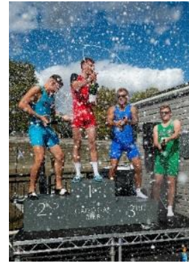
2019 Doggett's winners on the podium at Cadogan Pier

DOGGETT'S DAY – Cadogan Pier is proud to host, support and help organise the finish line and celebration of the prestigious and historic Doggett's Coat and Badge Race – the world's oldest rowing race. The Race has been running since 1715.