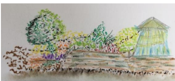
Painting from Cadogan Pier by a member of SMART

SMART – The health benefits of art and being close to the water have been widely acknowledged and we are delighted to support SMART – a local mental health charity, with their art lessons. We give them use of the Pier, our meeting space, refreshments and support from our team. “A very peaceful, little oasis in which to paint,” said a member of SMART on their last visit.