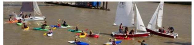
Our boat, the R.S Venture

WESTMINSTER BOATING BASE – We are long term supporters of Westminster Boating Base and have donated a new boat to help give opportunities for disadvantaged young people to learn to sail, acquire new skills and enjoy the river.