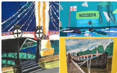
Winners of local school Art Competition