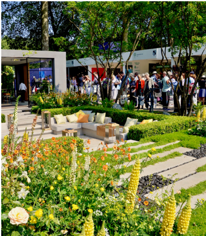
The 2018 Chelsea Flower Show in full bloom