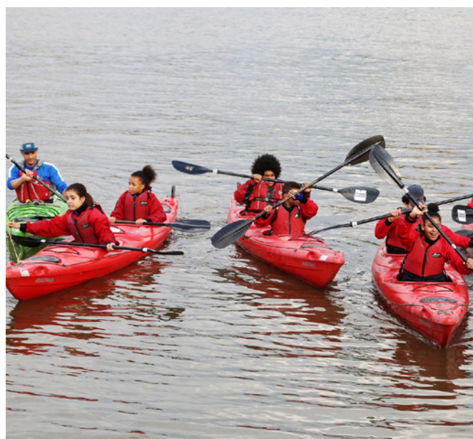
Kayaking lessons on the river