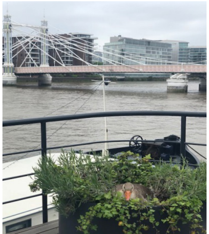
The geese have also been very prominent on the Pier this year